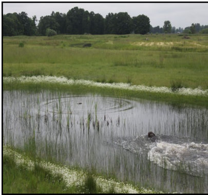
Justin Weaver and Dozer running the Green Valley Hunting Retriever water test as a test dog.