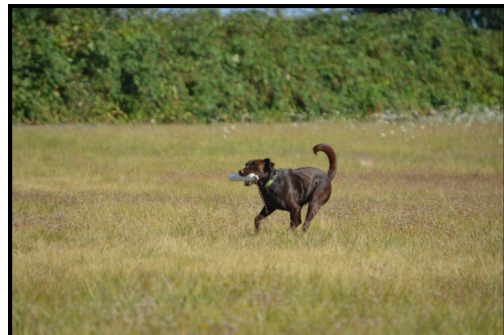
2nd Place: Tater handled by Brad Fenton.